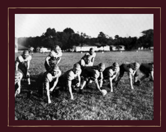
Football team, 1947

From 1851-1947, Florida State College for Woman - as its name suggests - was only open to females while men often attended the University of Florida in Gainesville. After the end of World War II, the abundance of veterans returning to the United States in search of a higher-education degree was more than the University of Florida could bare. Therefore, the then Florida State College for Women in Tallahassee became coeducational to serve the needs of the growing population in search of a degree.